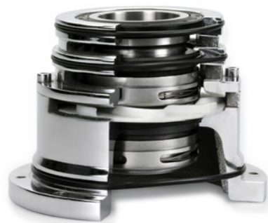
Unique Cartridge Seal